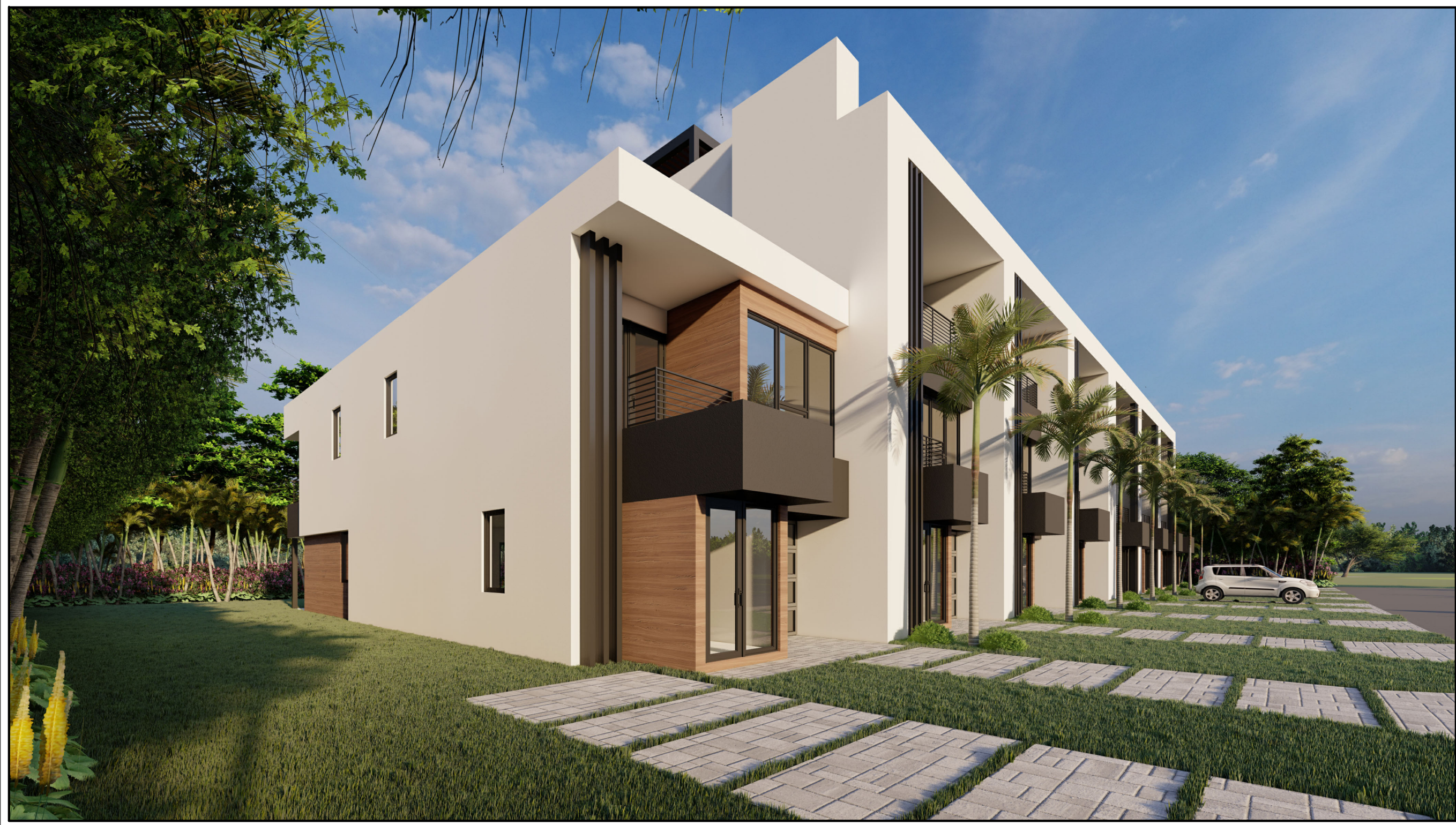
3D IMAGES - FRONT LEFT CORNER SCALE: NOT TO SCALE