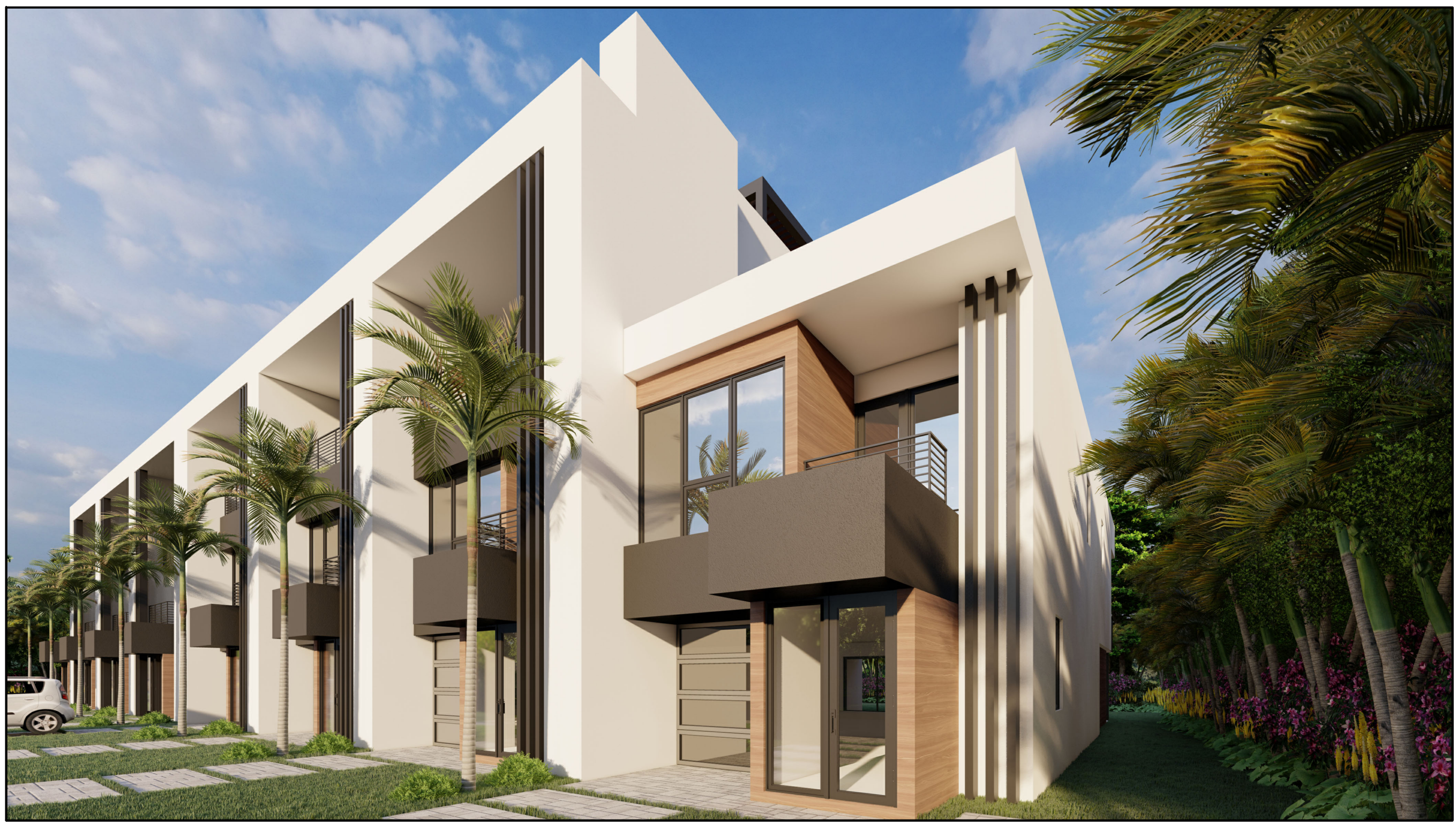
3D IMAGES - FRONT RIGHT CORNER SCALE: NOT TO SCALE