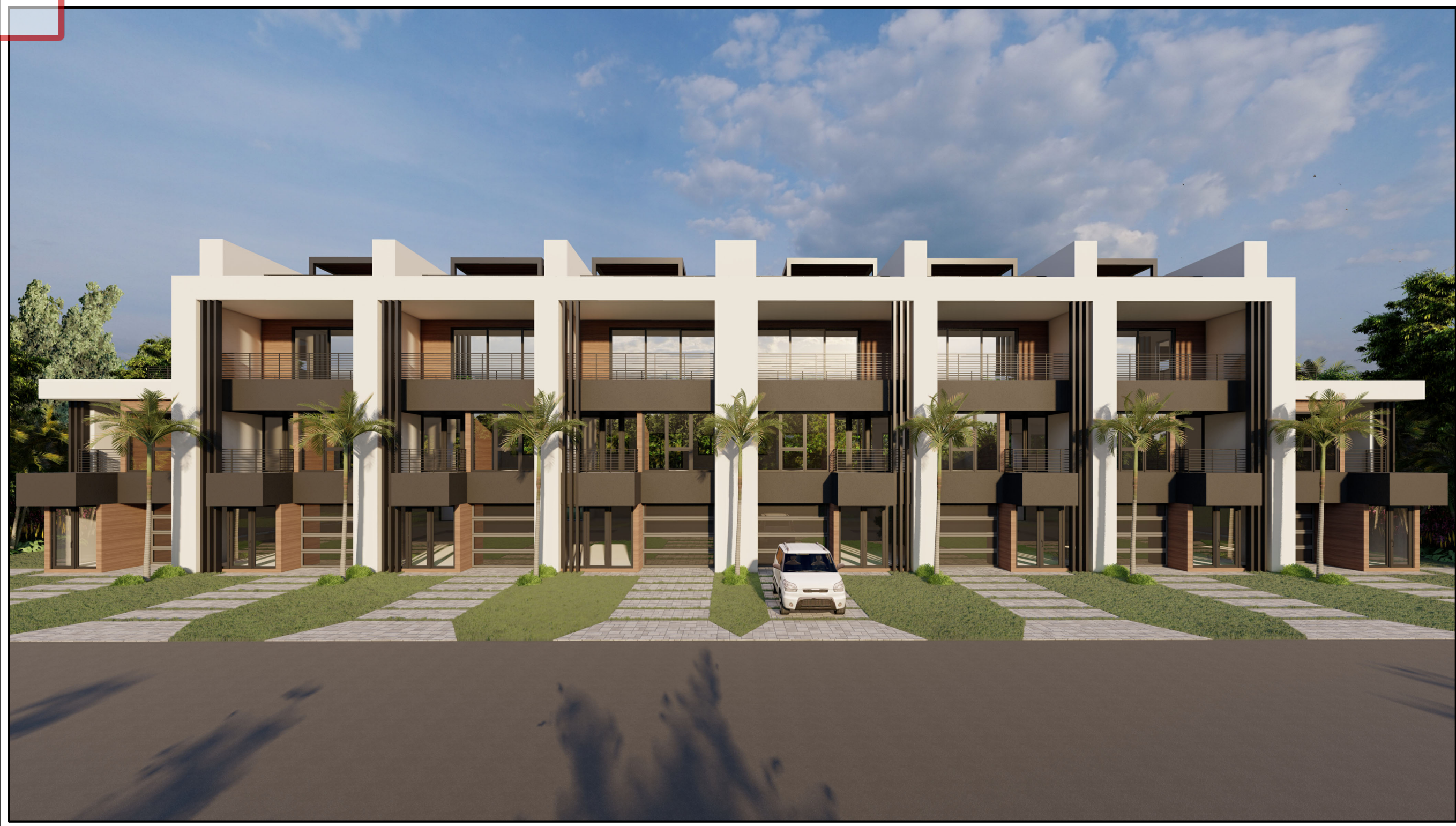
3D IMAGES - FRONT SCALE: NOT TO SCALE