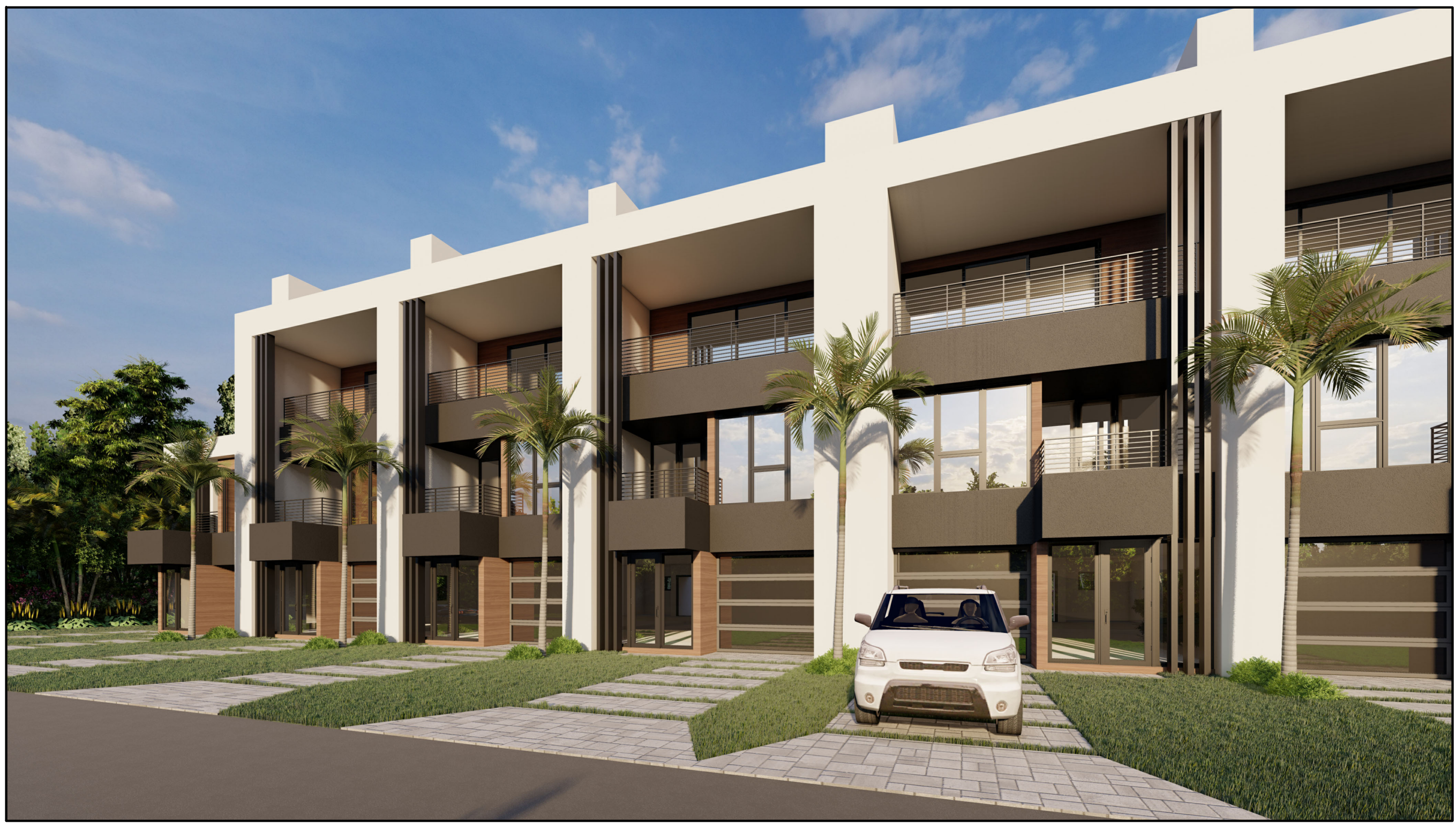
3D IMAGES - FRONT CLOSE SCALE: NOT TO SCALE